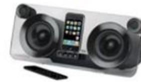
iHome iP1 Studio Series Audio System for iPod/iPhone