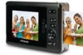
The PoGo Digital Polaroid Camera