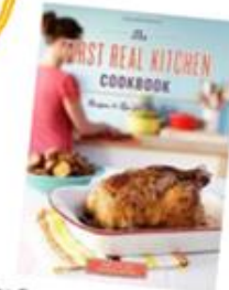
The First Real Kitchen Cookbook: 100 Recipes... $15.96