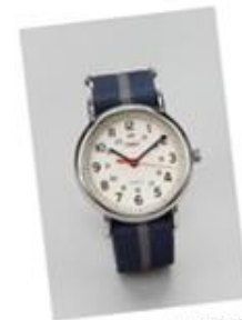
Timex Striped Band Weekender Cream Watch