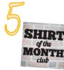
Shirt of the Month Club Subscription-$110 $110.00